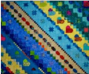
Happy Mystery Quilt in the upcoming Gallery of Fine Arts

"He who has a why to live can bear almost any how ." Friedrich Nietzsche