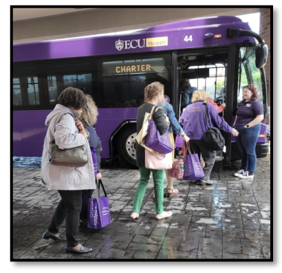
Loading the ECU bus