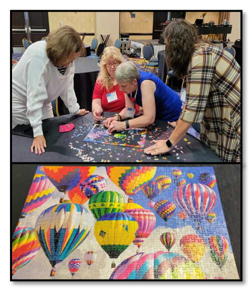
NC DKG leaders worked as a TEAM to complete their puzzle . . . the only team to finish the task.

Regardless of your position in DKG, you are part of at least one TEAM. Working together will result in success for your chapter, state, and international organization.